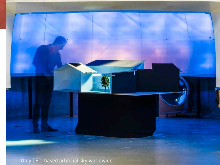
Only LED-based artificial sky worldwide.