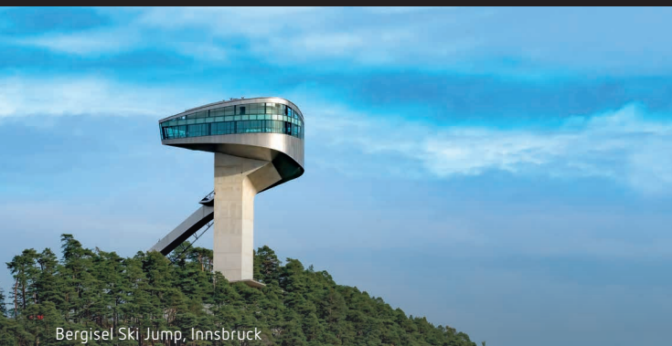
Bergisel Ski Jump, Innsbruck

Rinner Straße 14a | 6071 Aldrans | Austria +43 512 3338-0 | info@bartenbach.com www.bartenbach.com