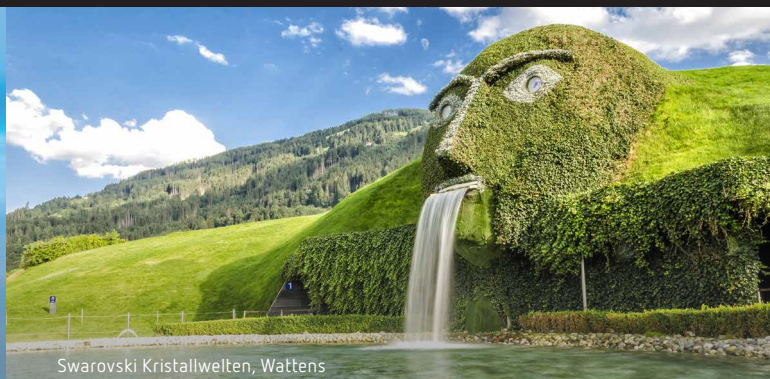
Swarovski Kristallwelten, Wattens