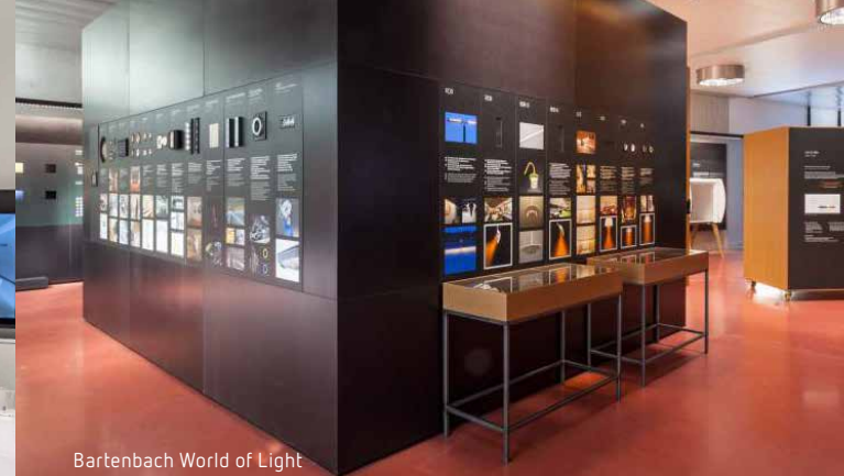
Bartenbach World of Light